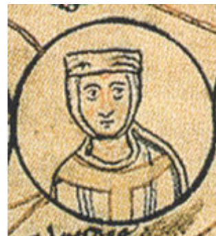
Matilda, Queen of Burgundy