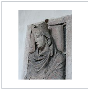
Tomb effigy of daughter Queen Hemma.