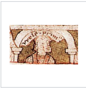
Husband Welf I