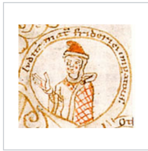
Daughter, Judith of Bavaria