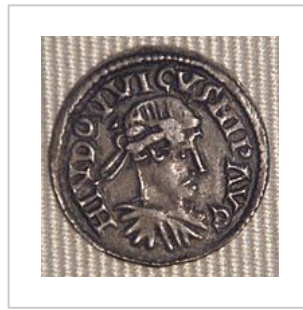
Son-in-law Louis on a denarius from Sens, c.818