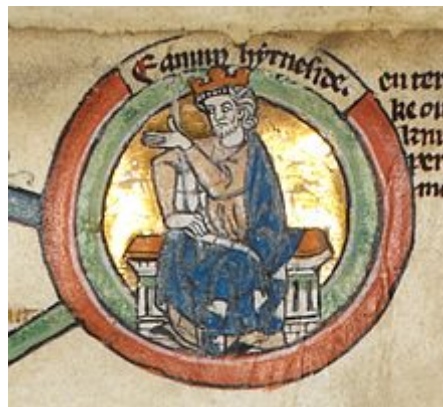
Edmund in the early fourteenth century Genealogical Roll of the Kings of England