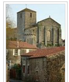
L'église de St. Nicolas, La Chaize

Early in 1090, he made war on Pierre de Mortagne and took his castle. The Viscount of Thouars was assassinated by two of his own knights in 1093. He was buried in the church of Saint Nicolas in La Chaize.